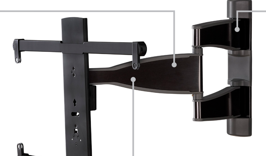
unwanted TV movement