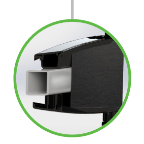
Precision-engineered, ultra-strong, solid steel frame provides maximum support