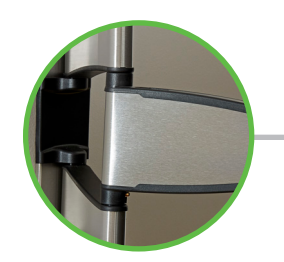
Stylish brushed metal exterior seamlessly blends with TV and décor