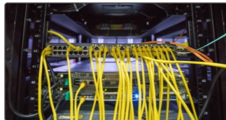
Integrated wiring network engineering

Telecommunications network line engineering and routine maintenance work; computer network line engineering; other metal wire line engineering and maintenance work.