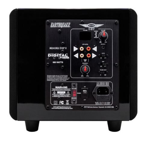
2x The Radiating Surface Area For A truly Impactful Bass Response From a Compact 10 Inch Cube